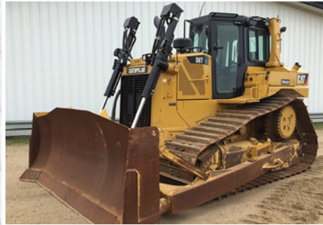
2012 Cat D6T XW (1 of 3)

2002 Sterling LT9500 1997 Ford LT9513 2000 Sterling L7500 1996 Ford F800 (2) 1999 Sterling LT9513 (2) 1998 Ford LT9513 (3)