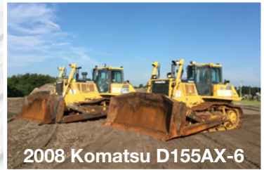
2008 Komatsu D155AX-6