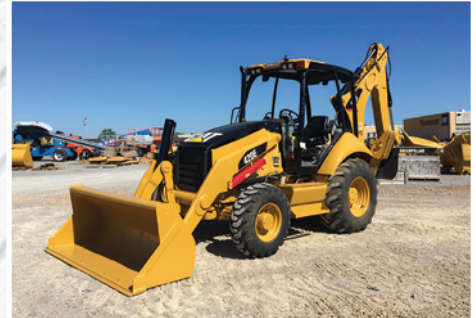
2012 Cat 420E