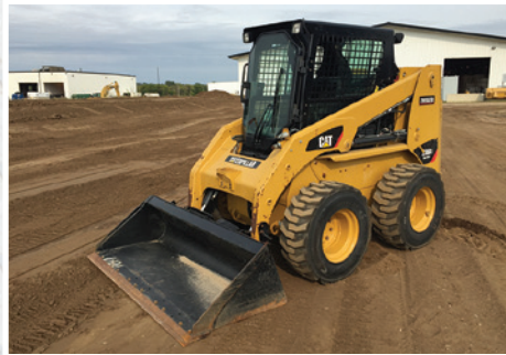
2012 Cat 236B3