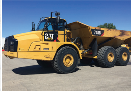
2012 Cat 740B (1 of 4)