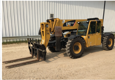
2007 Cat TL1055

2013 Cat CS66B 2012 Cat CS44 2002 Cat CS-563D (2) 2001 Hamm 2420D