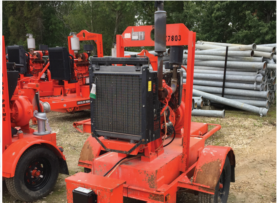
2011 Godwin CD103M