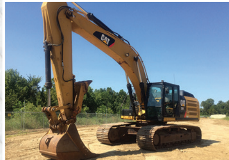
2011 Cat 336EL