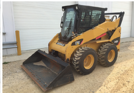
2011 Cat 242B3