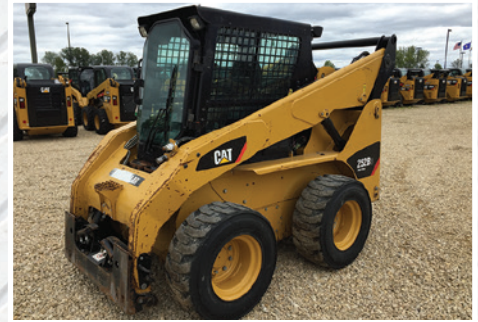
2011 Cat 252B3 (1 of 4)