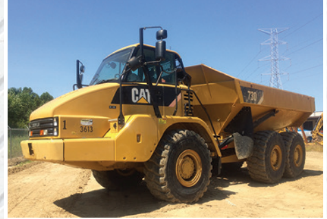
2012 Cat 730