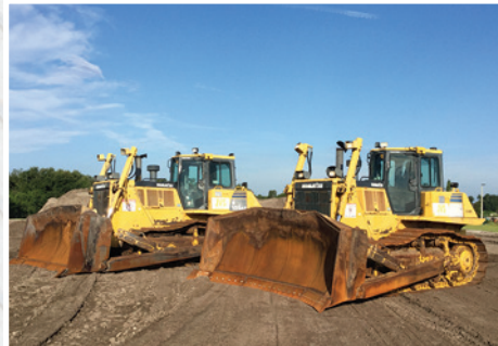
2008 Komatsu D155AX-6