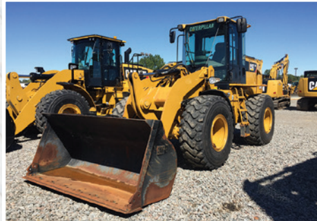
2012 Cat 928HZ