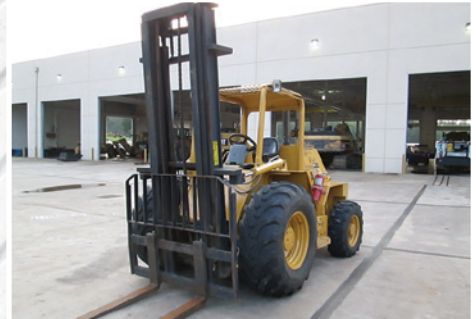
2012 Mastercraft C-08-10116 4x4