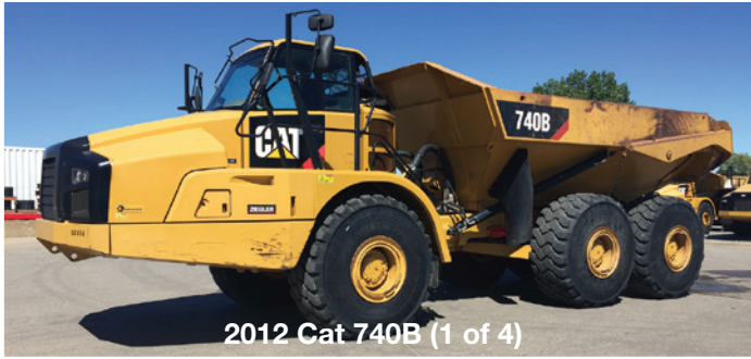
2012 Cat 740B (1 of 4)