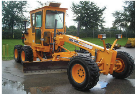
2012 LeeBoy 685

2012 Mastercraft C-08-10116 4x4 2003 JCB 930