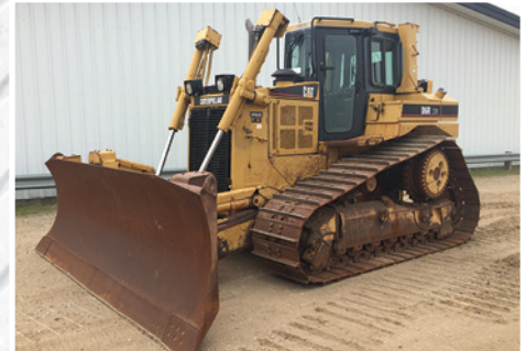
2007 Cat D6R XW