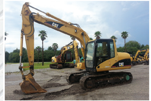
2005 Cat 312C