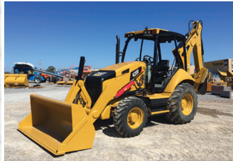
2012 Cat 420F (1 of 2)