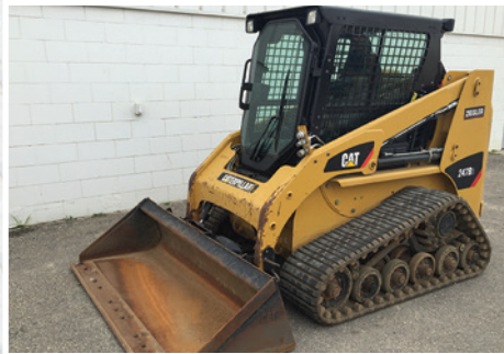
2013 Cat 247B3