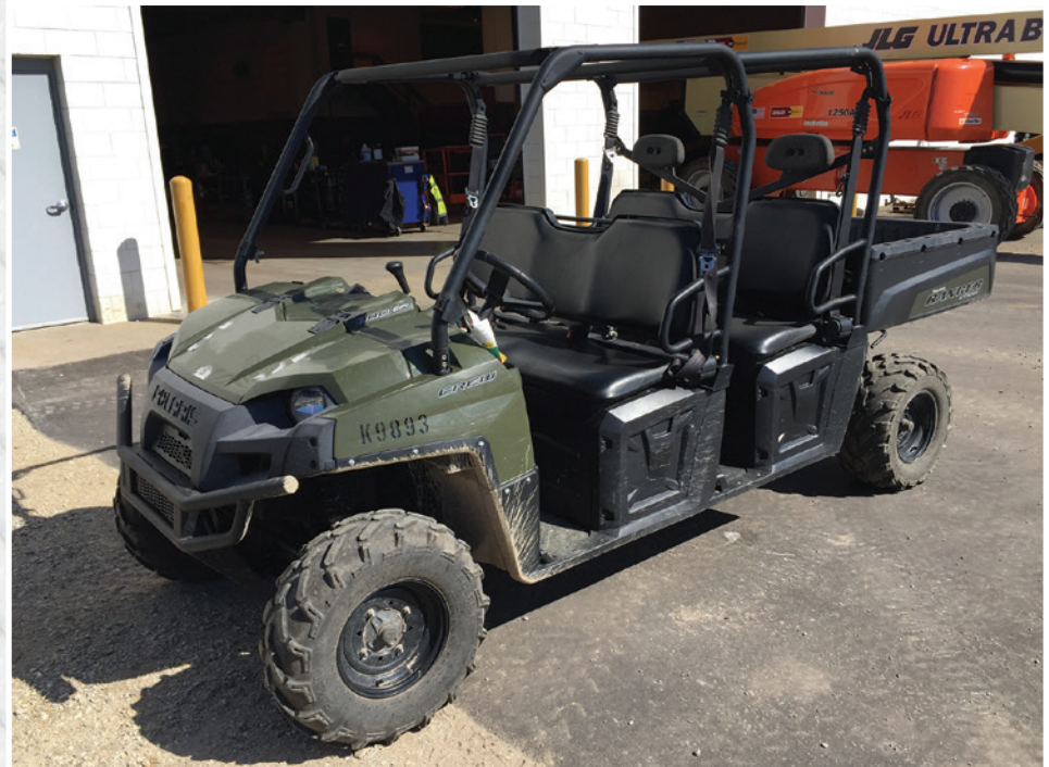
2013 Polaris Ranger Crew Cab