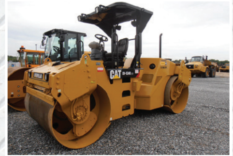
2008 Cat CB534D XW