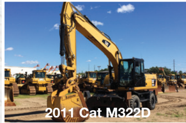
2011 Cat M322D