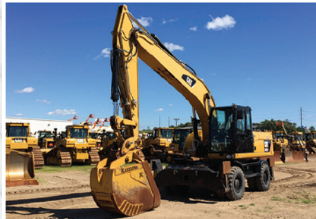
2011 Cat M322D