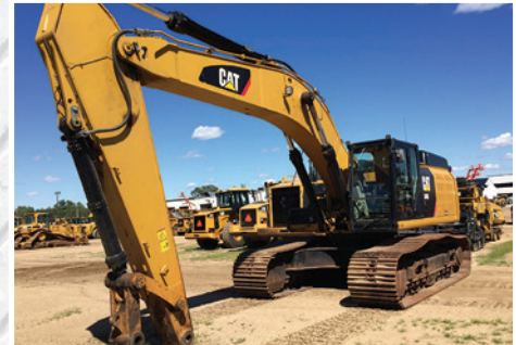
2011 Cat 349EL