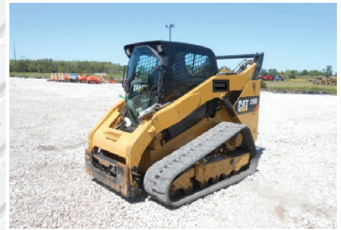
2012 Cat 299D