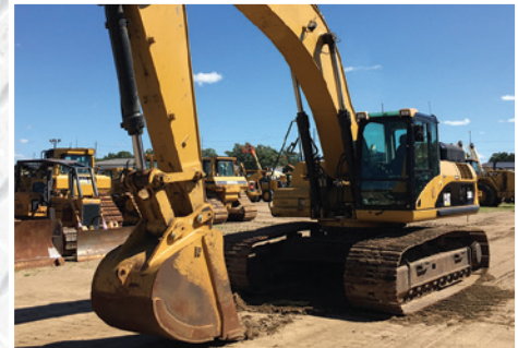
2008 Cat 330DL