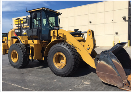
2012 Cat 950K