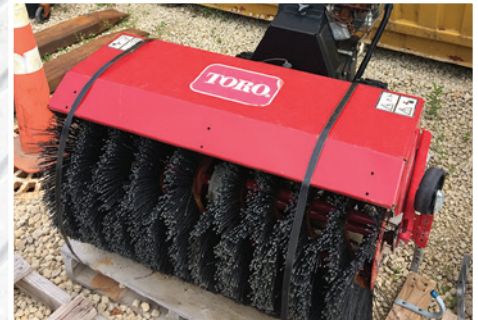
2013 Toro Broom (1 of 3)