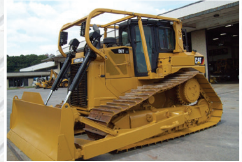
2011 Cat D6T LGP (1 of 2)