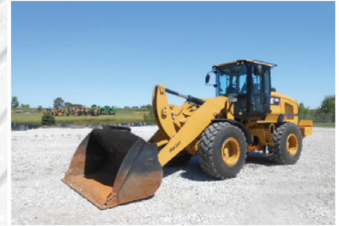
2012 Cat 938K High Lift