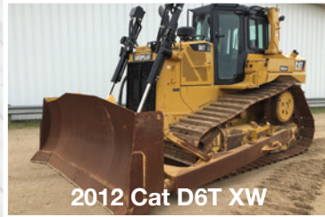
2012 Cat D6T XW