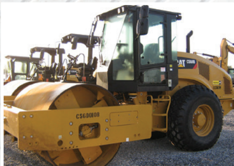
2013 Cat CS66B