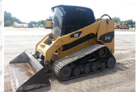
2008 Cat 277C (1 of 2)