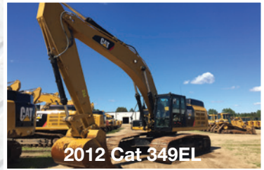
2012 Cat 349EL