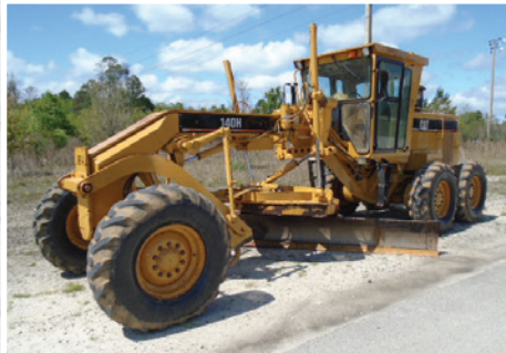
1996 Cat 140H NA