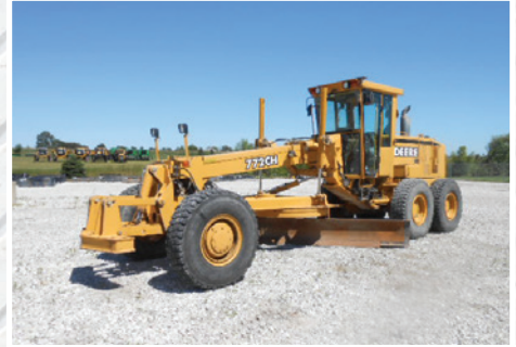
2000 John Deere 772CH