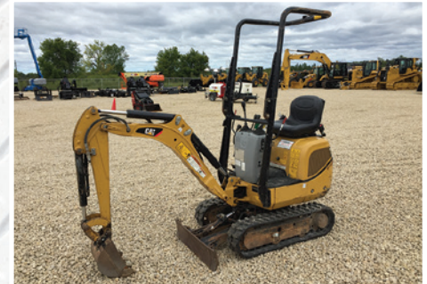
2012 Cat 300.9D