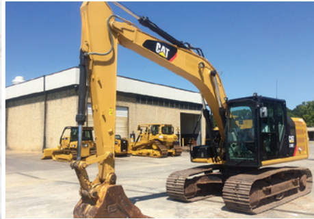
2012 Cat 316 EL

Wacker HDR155 Thor Frostbuster LD5030 (2)