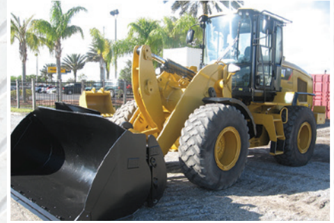
2012 Cat 930K (1 of 3)