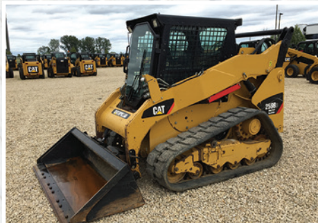
2012 Cat 259B3