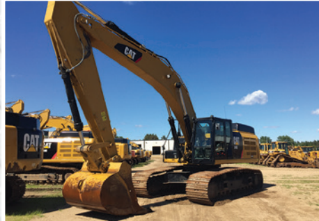
2012 Cat 349EL