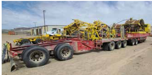
NOV Hydra Rig Coiled-Tubing Unit