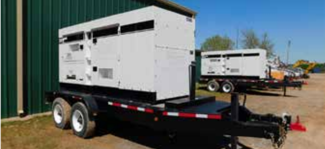
2014 MQ Power MQP240 Diesel Powered AC Generator