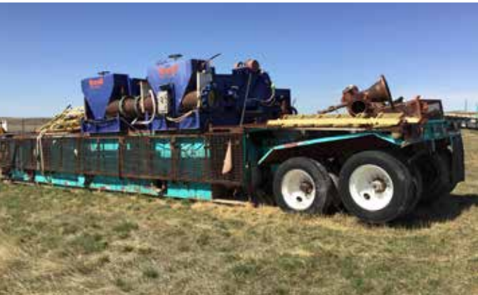
Brandt 3-Comp Mud Tank