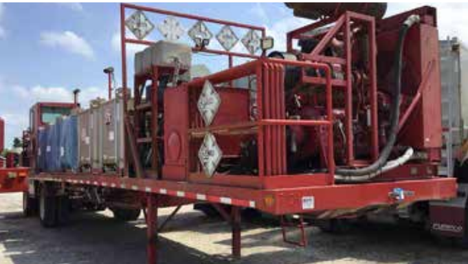
2011 Great Dane Chemical Injection Unit