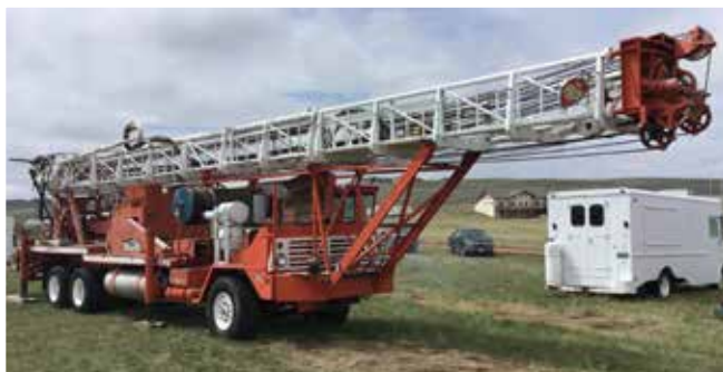
Failing Holemaster Drilling Unit