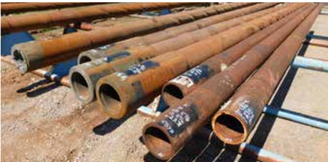
8-Inch Spiral Drill Collars