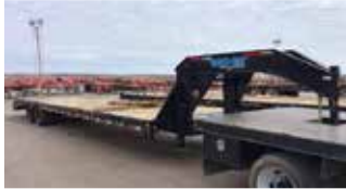
2019 Tophat Gooseneck Equipment Trailer