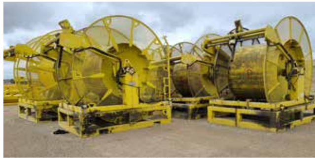
NOV Hydra Rig Coiled-Tubing Reels