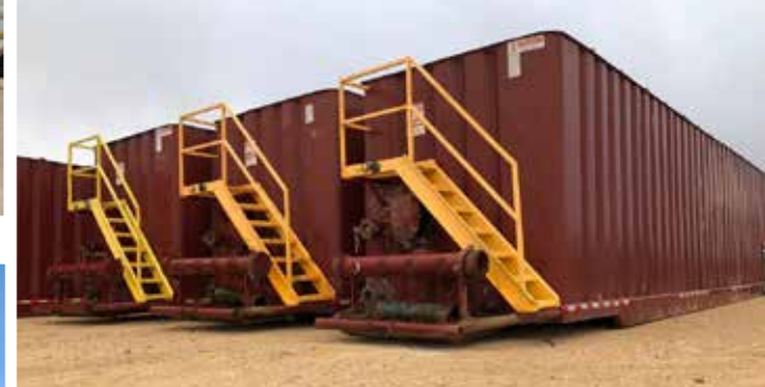
30 – Dragon 500-Bbl Frac Tanks