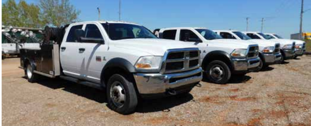
5 – 2012 Dodge Ram 5500HD Tong Trucks – Yd 2