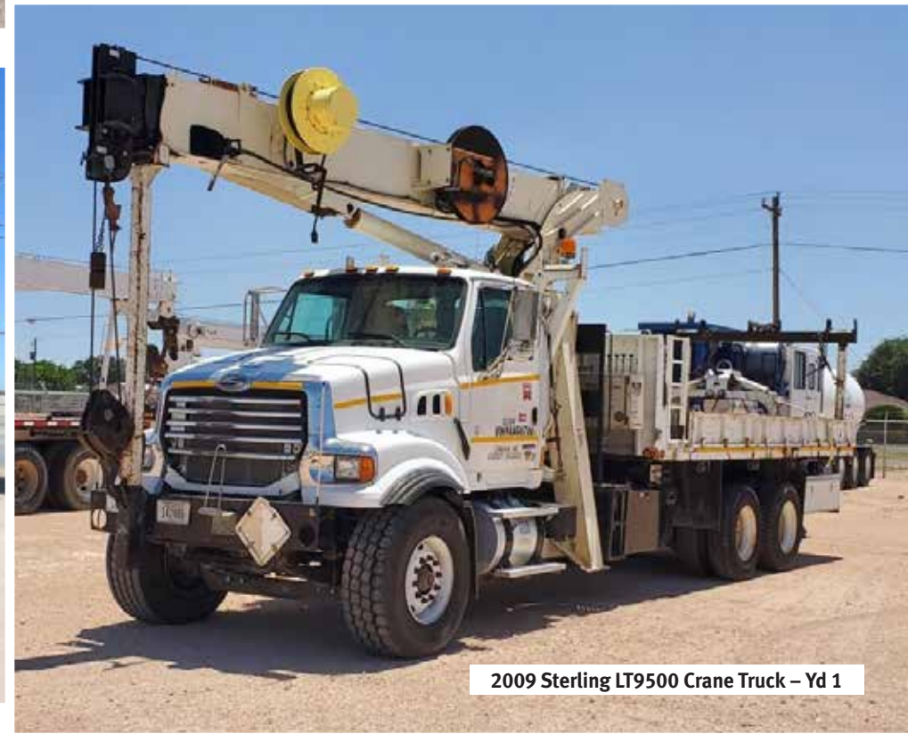
2009 Sterling LT9500 Crane Truck – Yd 1