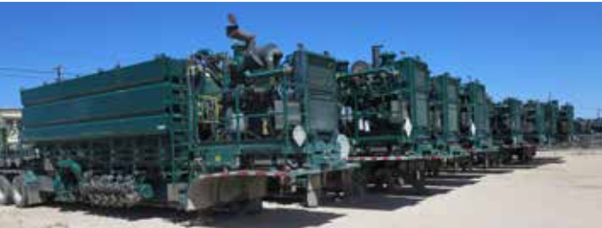
Enerflow 80BPM Hydration Units