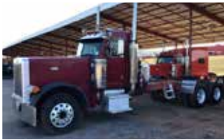
1998 Peterbilt 379 Winch Tractor