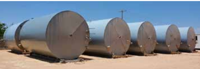
400-Bbl Round Skidded Tanks