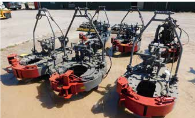
McCoy-Farr Hydraulic Casing Tong