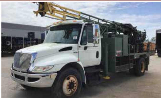
Central Mine Equipment Model-75 Water Well Drilling Unit