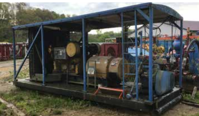
Gulf Electroquip 800KW Generator Set