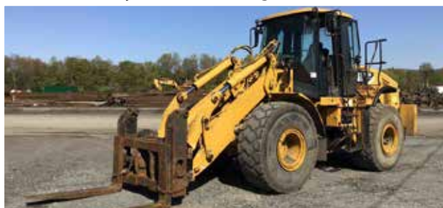
Caterpillar IT62H Front End Wheel Loader