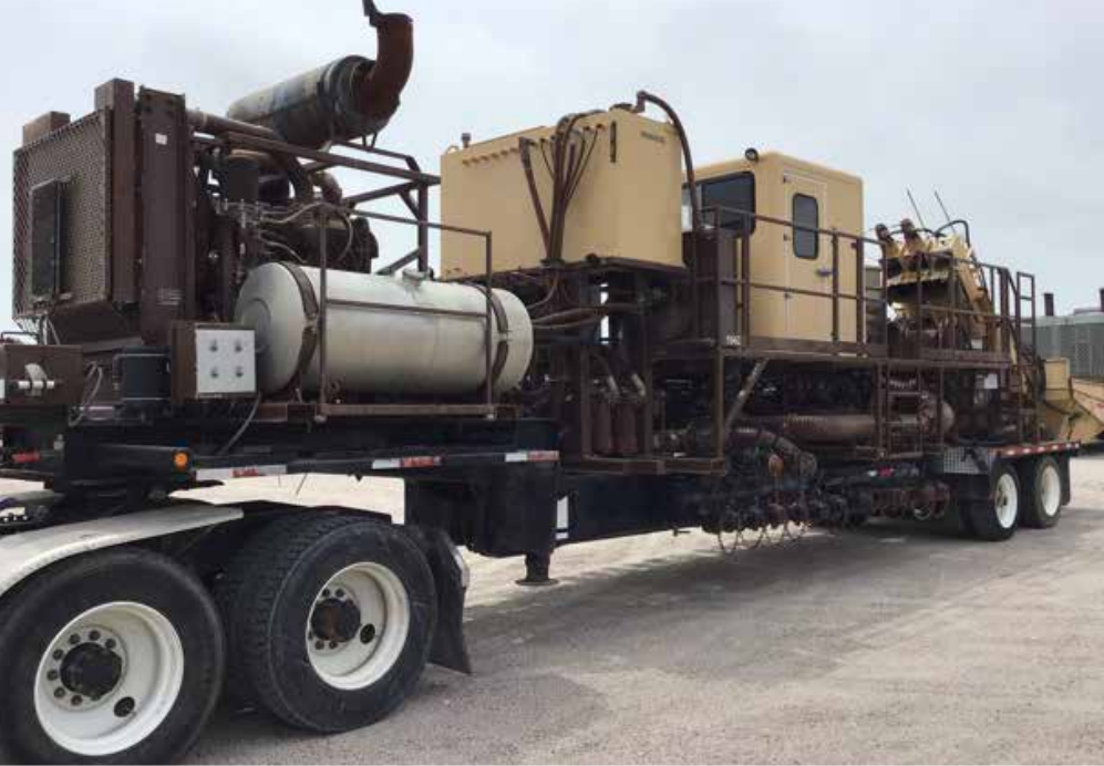
2008 SERVA 150-Bbl-Min Blender – Yd 8