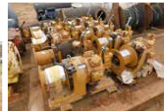
Unused 1-Ton Air Hoists