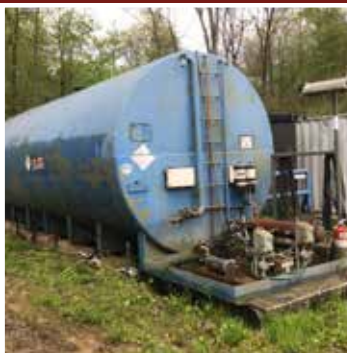
Round Fuel Tank