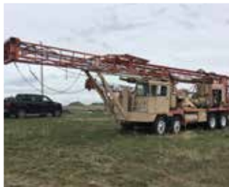
Franks 1500 Well Service Rig