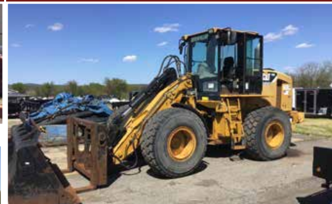
Caterpillar 930H Wheel Loader