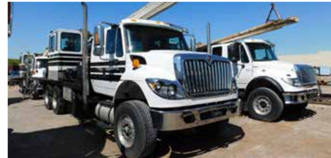
International Casing Laydown Trucks