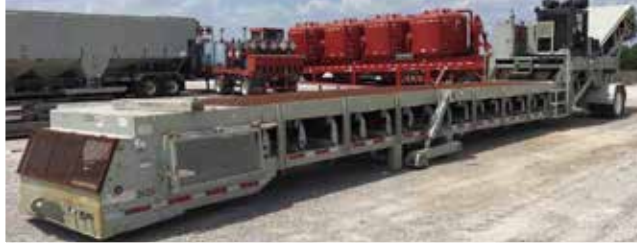
2011 Orteq T-Belt Sand Conveyor