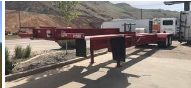
2014 Brumley BM624 Stick Trailer