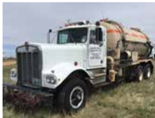
1980 Kenworth W900 85-Bbl Vacuum Truck