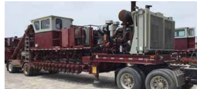
2013 ORTEQ Twin 100-Bbl-Min Double Blender