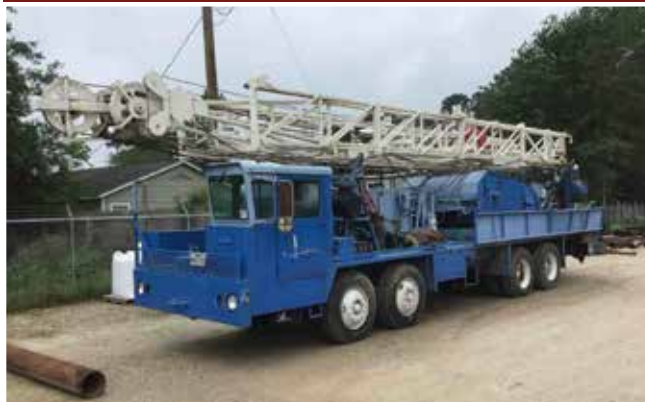
1983 Wilson Super-32 DD Water Well Drilling Rig