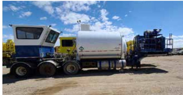
Triplex Nitrogen Pump