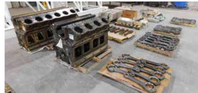
Caterpillar Engine Blocks & Unused Surplus