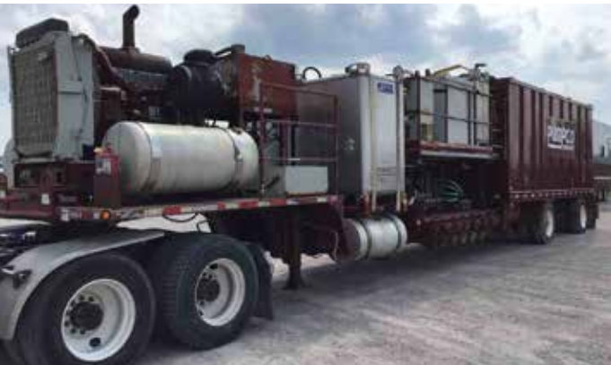
2010 MAD Hydration Unit Trailer