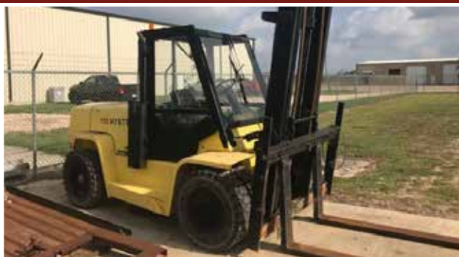
Hyster Rough Terrain Forklift