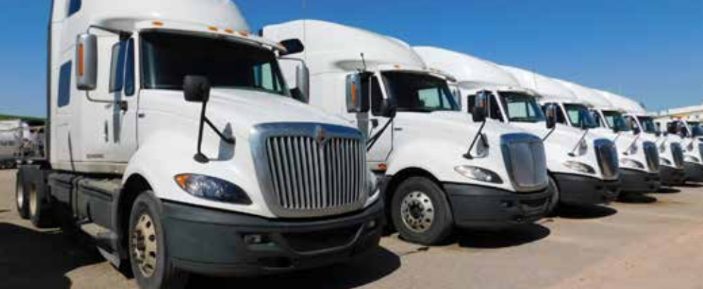
20 – International ProStar+ Truck Tractors – Yd 2