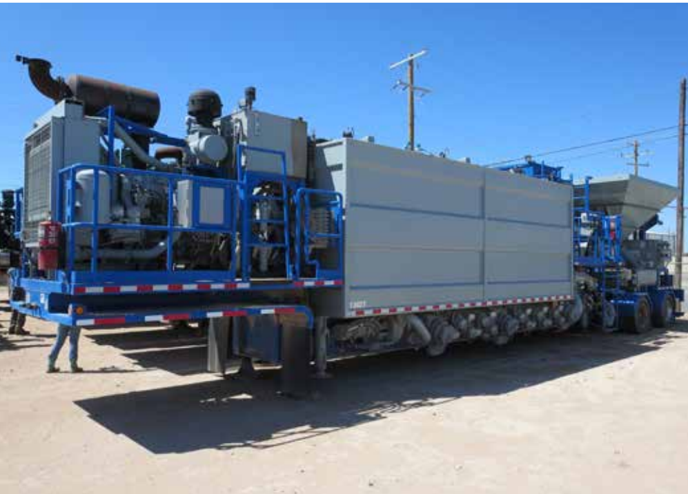
Loadcraft 100BPM Dry-Hydration Unit – Yd 1