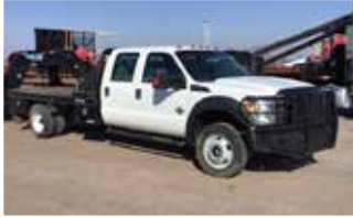
2012 Ford F450 Pickup