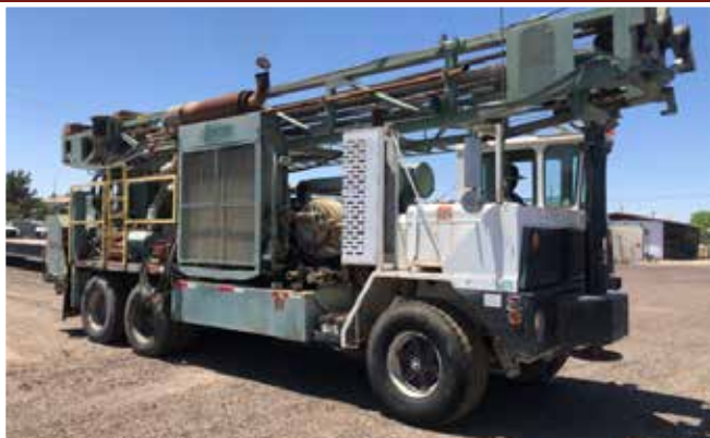
Ingersoll Rand T4W Water Well Drill Truck