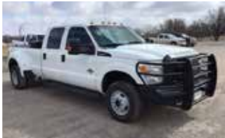
2015 Ford F350XL Pickup