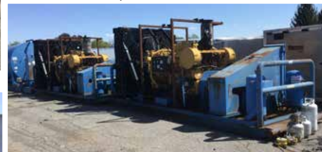
Caterpillar 3512 Diesel Engine Power Units