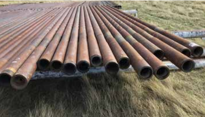
Spiral Drill Collars