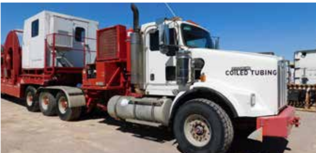
2009 Kenworth T800 Hydra Rig CTU Tractor