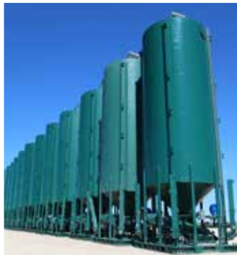
Vertical Sand Silos