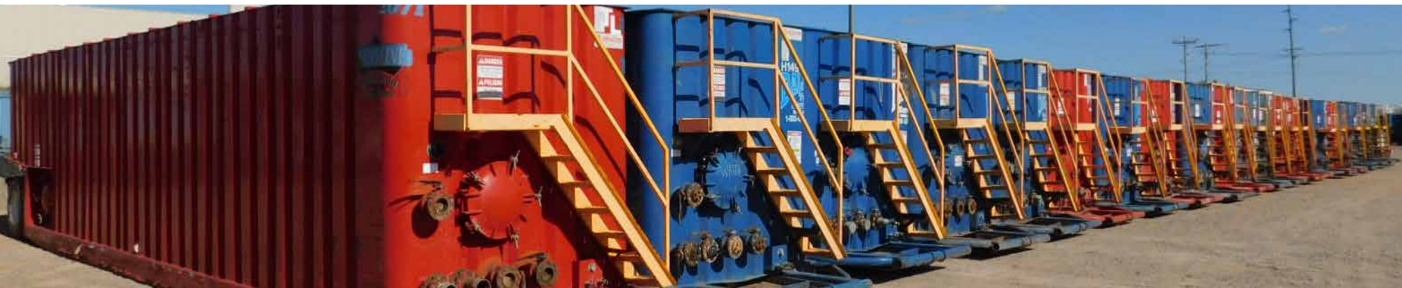
20 – Dragon 500-Bbl Frac Tanks – Yd 2