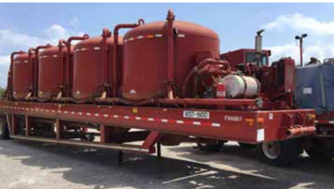
2011 Wilco Fab 1600CuFt Laydown Bin Trailer