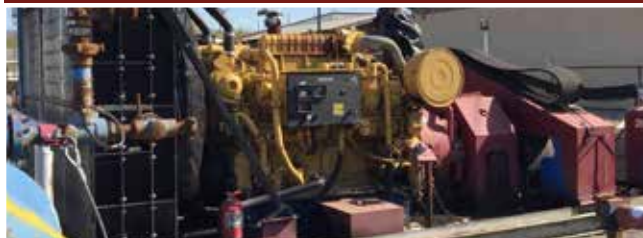
Caterpillar 3512 Diesel Engine Power Unit