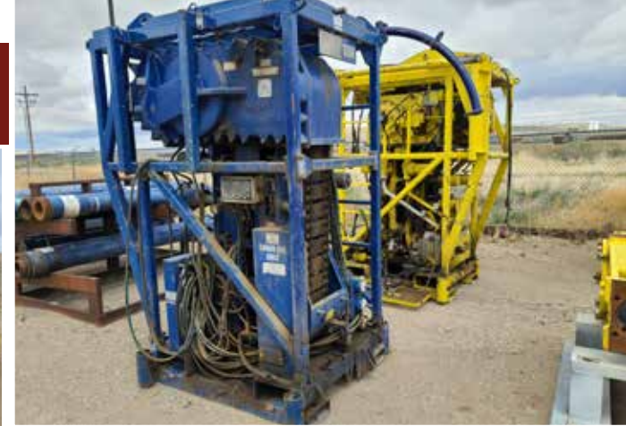
NOV Hydra Rig Injector Heads

2015 NOV HYDRA RIG Coiled-Tubing Trailer w/Booster (2) NOV HYDRA RIG Nitrogen Pumpers (7) NOV HYDRA RIG Coiled-Tubing Reels (25) Coiled-Tubing BOPs, Risers, & Strippers