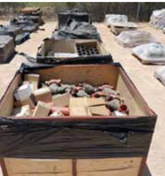
Unused Production Surplus