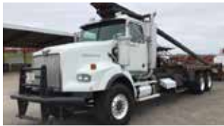
2007 Western Star 4900EX Bed Truck