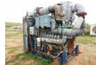
Detroit MTU 12V-2000 Diesel Engine