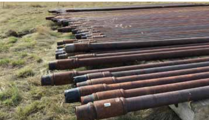
4-Inch G-105 Drill Pipe