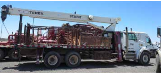
Sterling Crane Truck