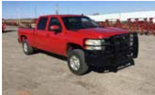
2007 Chevrolet 2500HD Pickup