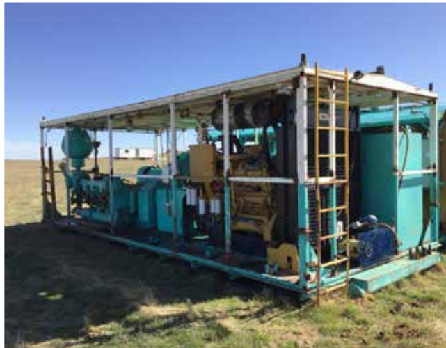
Gardner Denver PZ8 Triplex Pump