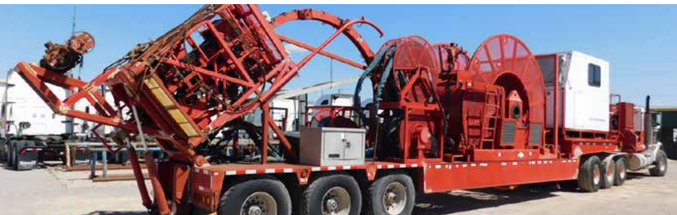
NOV Hydra Rig 560 Coiled-Tubing Unit – Yd 2