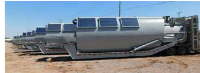
20 – MERTZ Sandcastles