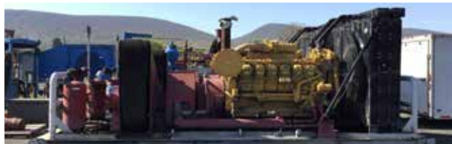
Caterpillar 3512 Diesel Engine Power Unit