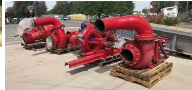
Gorman-Rupp & Mission Cent Pumps