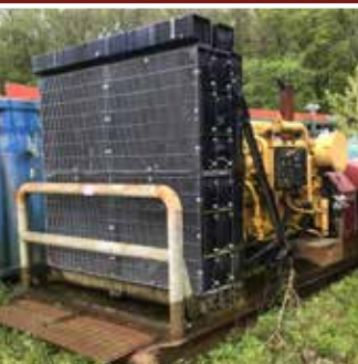
Caterpillar 3512 Diesel Engine Power Unit